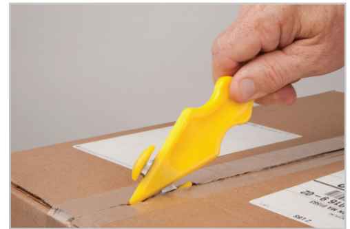
Versatile for cutting boxes, bands, shrink wrap, twine and more