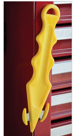
Magnetic base for hands-free use

For Additional Information or to purchase, please contact: